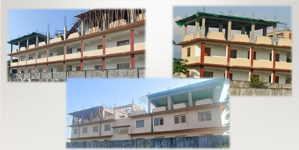
RKM UP SCHOOL, KALATEK OLD

The Border fencing between India and Bangladesh runs behind this school. In fact our school is located after the BSF outpost. Illiteracy is very high in this area. Some progressive people of the area took initiative to start a school. Initially the villagers conducted the school by constructing the school with bamboos and strew. But the villagers being poor, they could not sustain the enterprise. They approached the mainland Khasi community whose land they till for livelihood and the local government without any result. Finding no sympathy they approached Ramakrishna