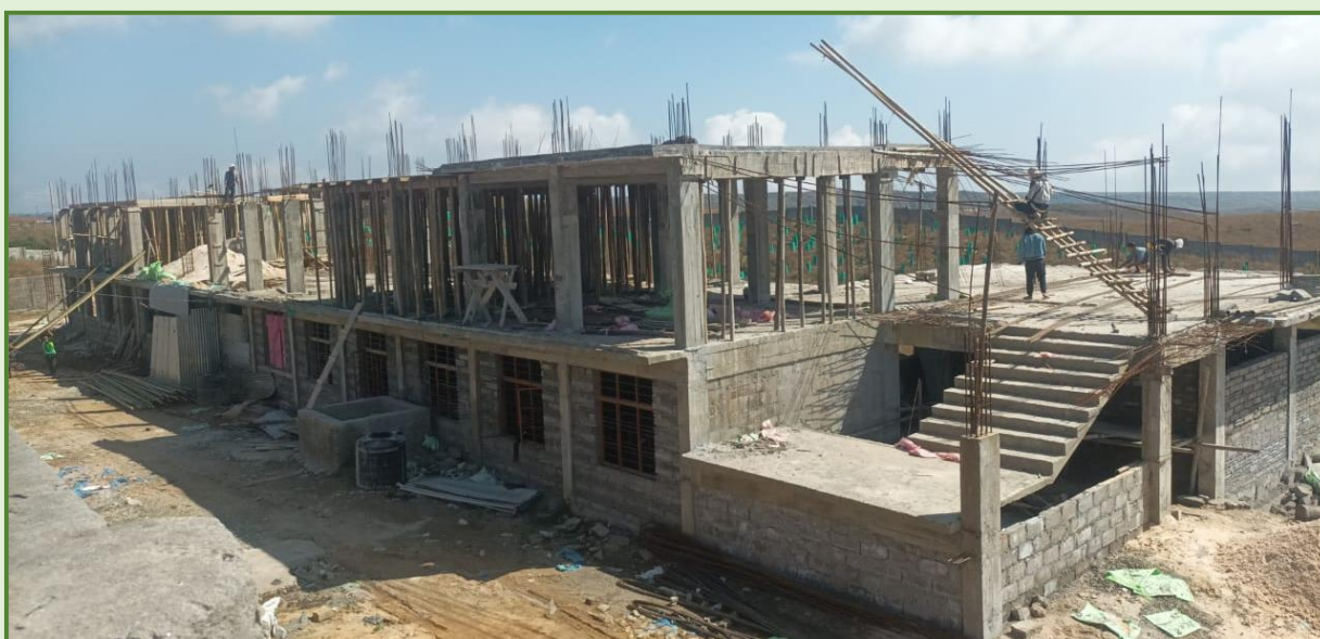
Photo: New school building